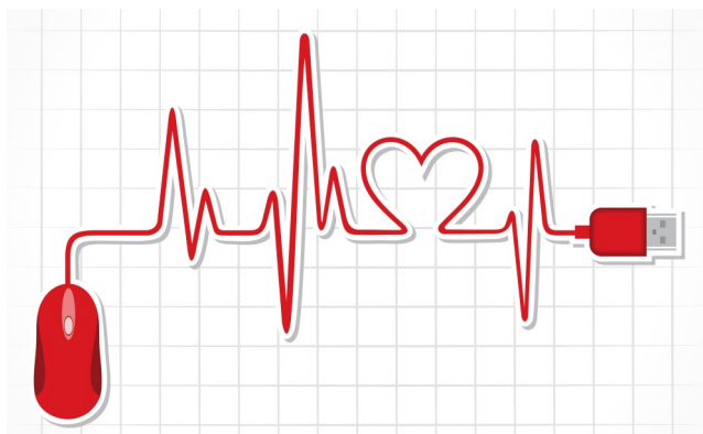
ANZSCTS Database Brochure v1.3 2018